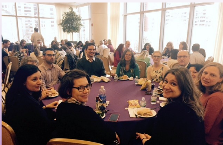
Midwest Training Conference Attendees

The purpose of the workshop was both to 1) educate faculty in the Gunderson approach to the treatment of borderline personality disorder and 2) to train them to supervise psychiatry residents in the method.